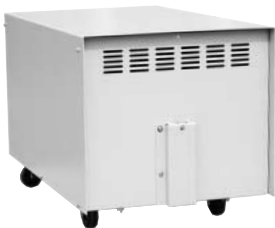
KS5 cabinet model

POWER BATTERY offers an extensive line of pre-wired and fused battery cabinets complete with UL and CUL approval. Standard and custom DC voltages complete with breakers and chargers are available.